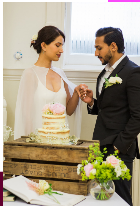
Images (clockwise from top): © Dan Weill © Belinda Burton Photography © Belinda Burton Photography