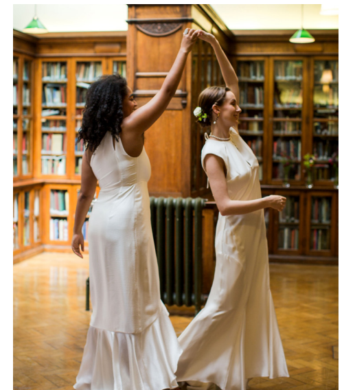
Images (clockwise from top): © Kathleen Arundell © Belinda Burton Photography © Belinda Burton Photography