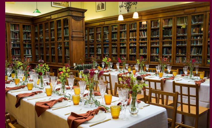
Top Image: Staircase leading to Upper Hall, © Dan Weill Bottom image: Library laid out for seated dinner, © Belinda Burton Photography