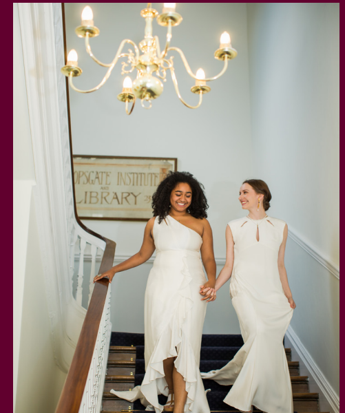
Images (clockwise from top left): Architecture of Bishopsgate Institute exterior by Charles Harrison Townsend, 1894. © Dan Weill Staircase leading to Upper Hall, © Dan Weill © Belinda Burton Photography Bishopsgate Institute Great Hall. © Dan Weill © Belinda Burton Photography